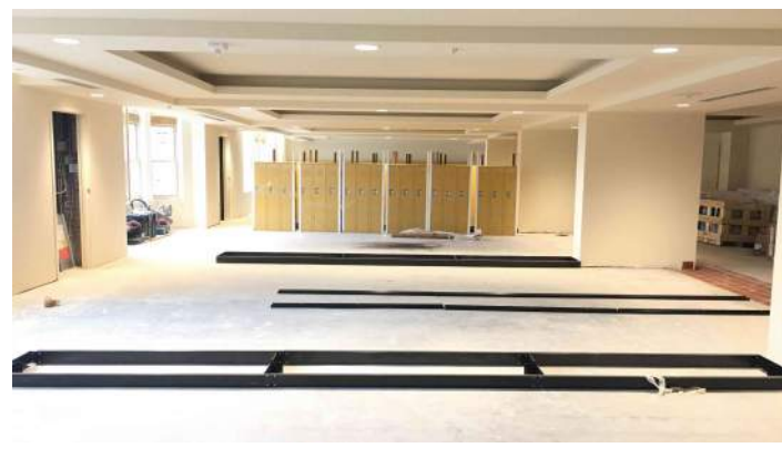
Locker Installation in 2nd Floor Area G