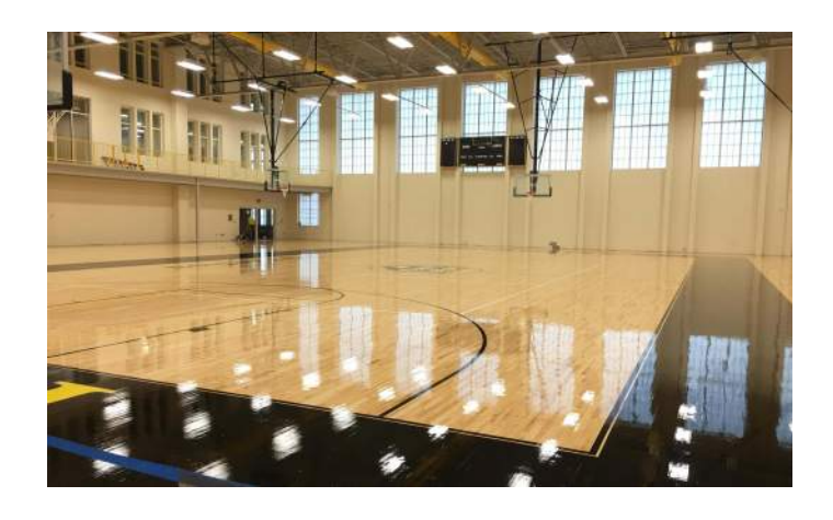
Floor Striping in Competition Gym