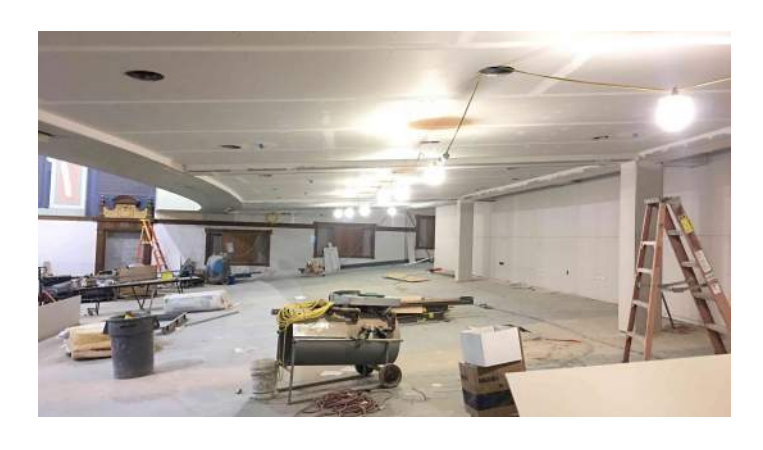
Drywall Installation in Cedar Level Auditorium