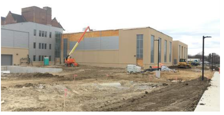
Grading Along Washington Blvd.