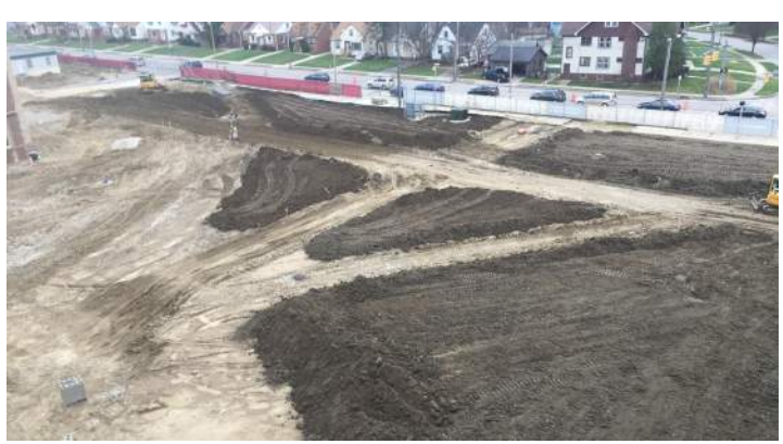
Grading in Courtyard Along Cedar Rd.