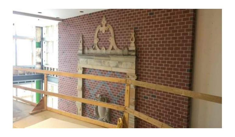
Interior Veneer Stone Area F Atrium